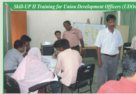
Skill-Up II Training for Union Development Officers (UDOs)

The LMTC Exposure Type includes the following four kinds of study visits: 1) study visits to another country; 2) study visits to other similar projects; 3) study visits to other project areas of PRDP; and 4) receiving visitors from other projects or organizations. In other words, the