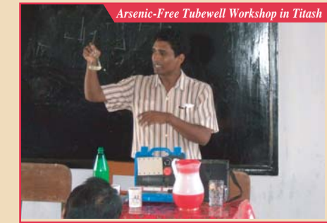
Arsenic-Free Tubewell Workshop in Titash

The Field Proposal Type consists of three groups: 1) Exchange Programs;