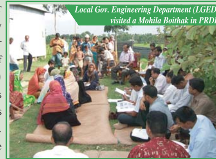
Local Gov. Engineering Department (LGED) visited a Mohila Boithak in PRDP

LMTC Exposure Type means intra-and-inter-project study tours managed by LMTC.