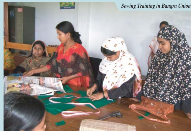
Sewing Training in Bangra Union