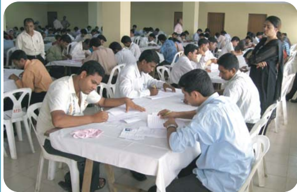
Prospective UDOs/Os are attending examination held at BRDB headquarters last May.

In May 2007 four UDOs and five Organizers were recruited through written and interview examination organized by respective committees. Successful recruits for UDO are from Tangail (3) and Netrokona (1); and for Organizers from Tangail (3), Kushtia (1) and Ponchagar (1). Two of the UDOs were those promoted from incumbent Organizers. We wish their prospective careers.