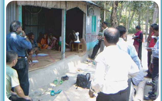
An OJT scene of the Bulletin Workshop at Pichutia GCM, Bangra union, Kalihati.